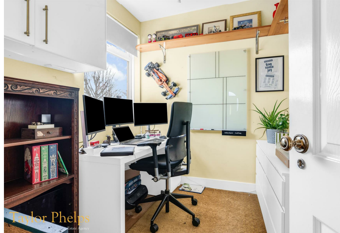
Taylor Phelps Estate Agency