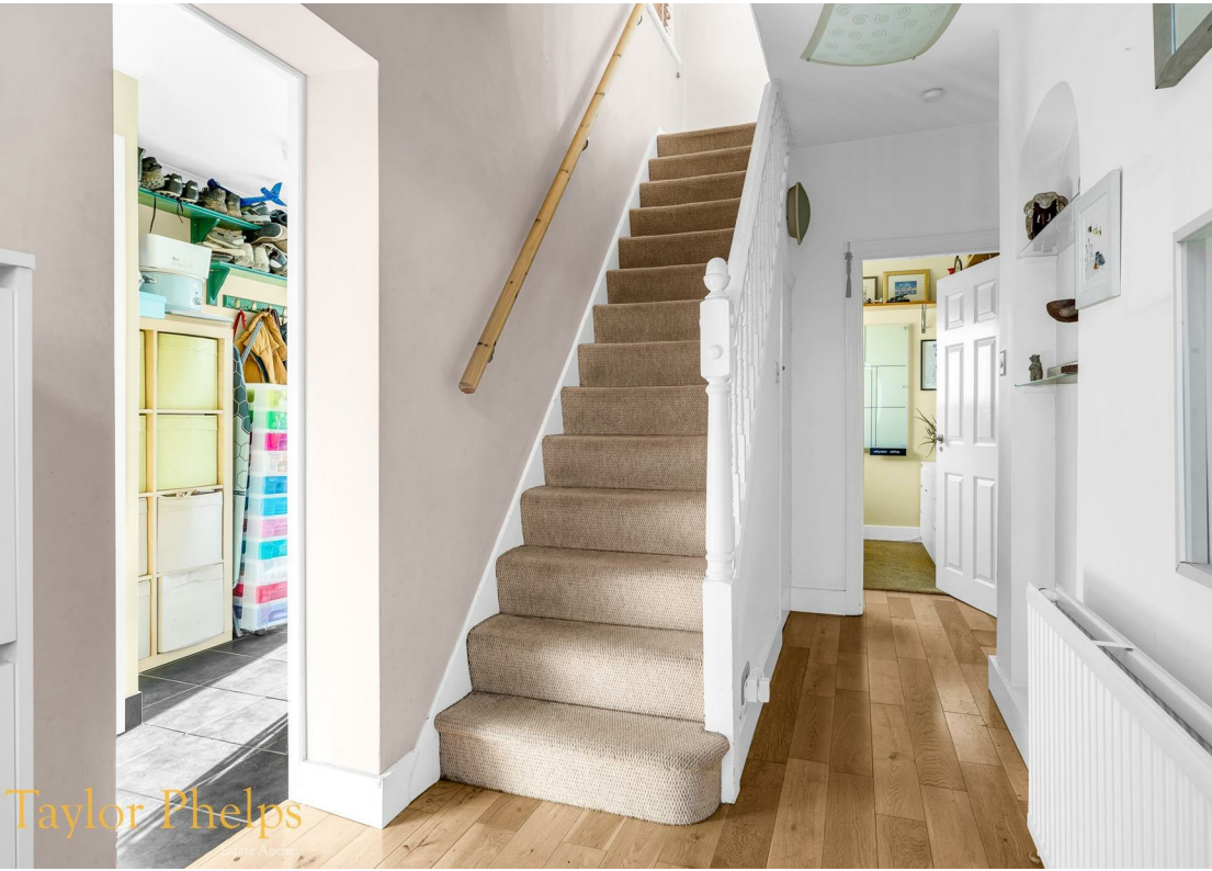
Taylor Phelps Estate Agency